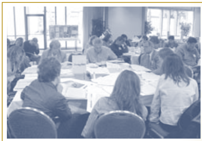
Participants at the Wenatchee training, funded by the Rural Domestic Violence and Child Victimization Grant, read the case study before beginning a team exercise.

Comment from the Shelton training evaluations.