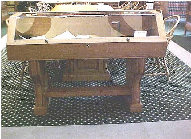
New Display Case in Main Reading Room

Please do not hesitate to ask us about the location of materials.