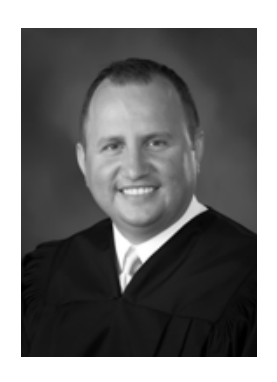
JUDGE SALVADOR MENDOZA, JR.

United States Court of Appeals, Ninth Circuit salvador_mendoza@ca9.uscourts.gov 509-943-8160