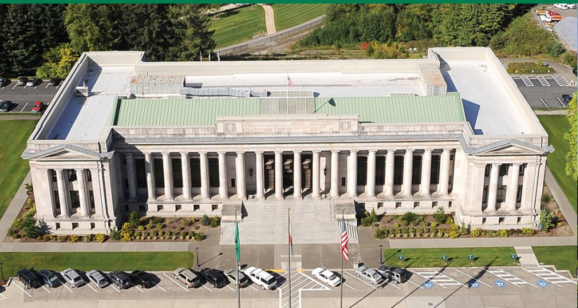
AERIAL VIEW OF BUILDING

ADA Access is available through the East Entrance of the Building (side facing Cherry Lane). If you need ADA access, please use the intercom located at the East Entrance.