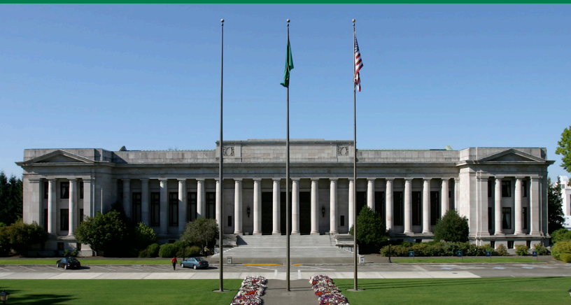
FRONT ENTRANCE OF BUILDING