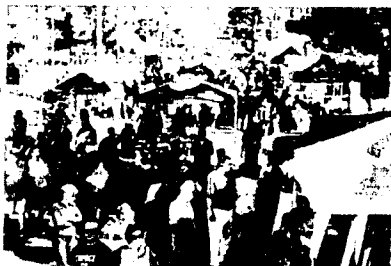
Fair on 44th Community Event

Lynnwood is a welcoming and active community that values: positive change; racial diversity, equity, and inclusion. Lynnwood is a remarkably diverse community with nearly 40% of