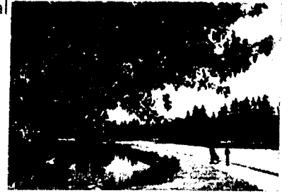
Lynnwood Municipal Golf Course

Year-round recreational options include a municipal golf course, 22 city parks, public tennis and basketball courts, sports fields, and the Lynnwood Recreation Center featuring 5 swimming pools, 2 water slides, a water playground and a 3,000-square foot cardio/weight room.