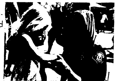
Lynnwood Police Department Community Engagement

The City of Lynnwood is in good financial condition backed by sound fiscal policies and practices earning a AA+ bond rating by S&P. The new Assistant Court Administrator will have the opportunity to work with dedicated staff and positively shape the future of the organization in one of the most vibrant, beautiful areas in the Pacific Northwest!